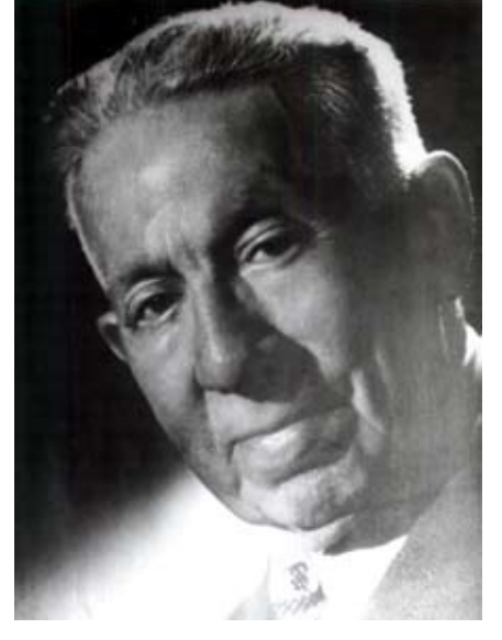
By {ROLANDO GARIBOTTI}

They came from all across the globe. others came simply